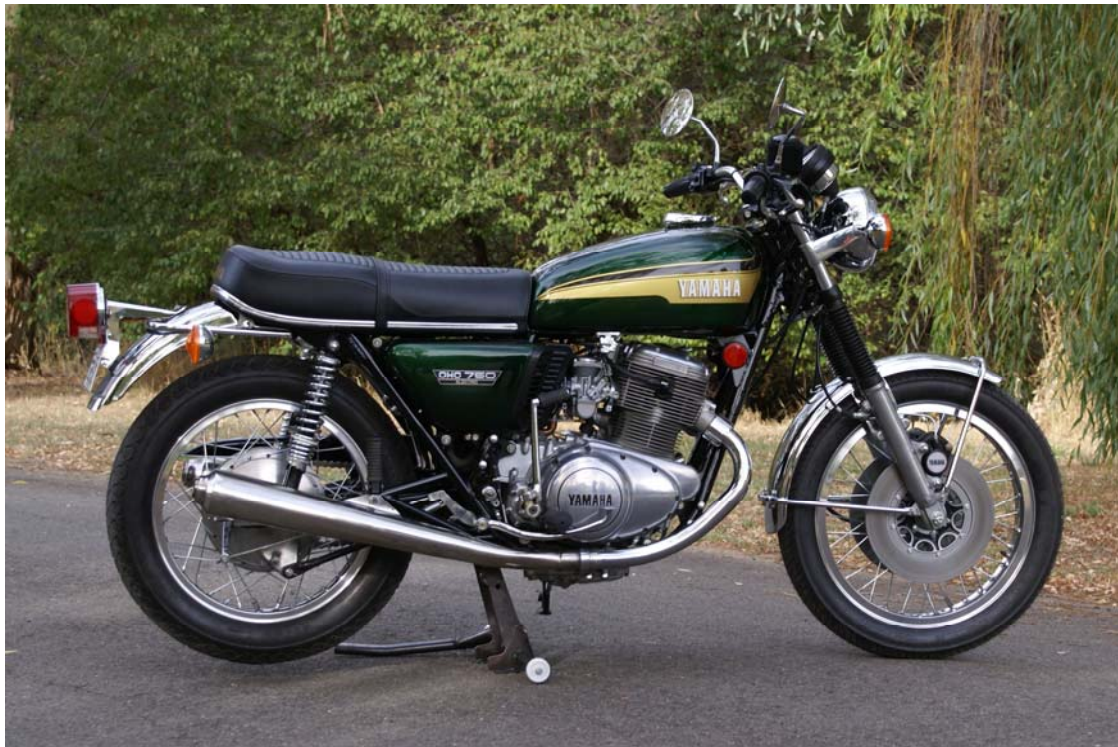
Nick's TX 750 – "made up from bits lying around the shed"