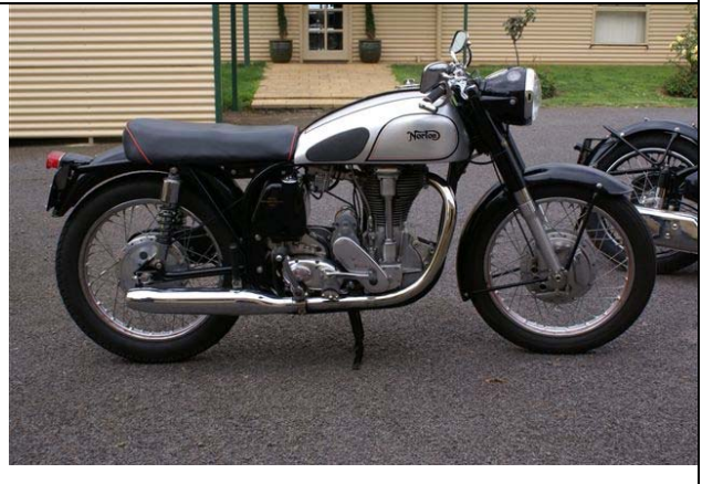
Nice Bits of Kit – Photos Courtesy of Nick Clarke.